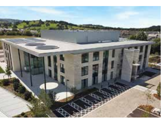
Ecclesiastical's office in Gloucester

Ecclesiastical Planning Services works with funeral directors across the country, providing a safe home for your funeral plan pre-payment funds.